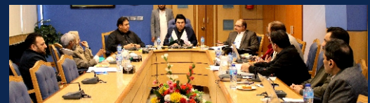
Finance Department in attendance. The company's financial affairs were reviewed.